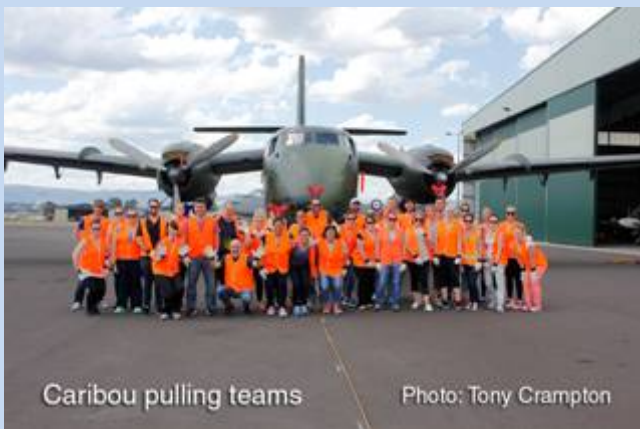
Caribou pulling teams

HARS Aviation Museum regularly hosts functions for external organisations and in December a well known travel agency utilised our facility for their annual conference. A surprise team building exercise was held at the end of the conference where the attendees were split into two teams and challenged to pull our two DHC-4 Caribous, weighing in at 7,675 kg each (empty weight), in a race along the tarmac to the finish line. The group really enjoyed this exercise before joining their coach to return to Sydney.