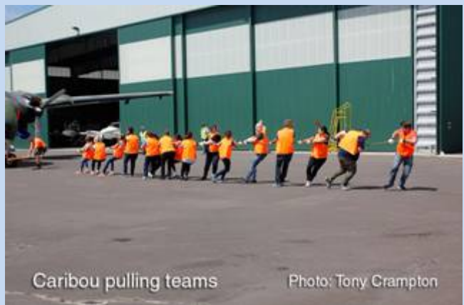
Caribou pulling teams