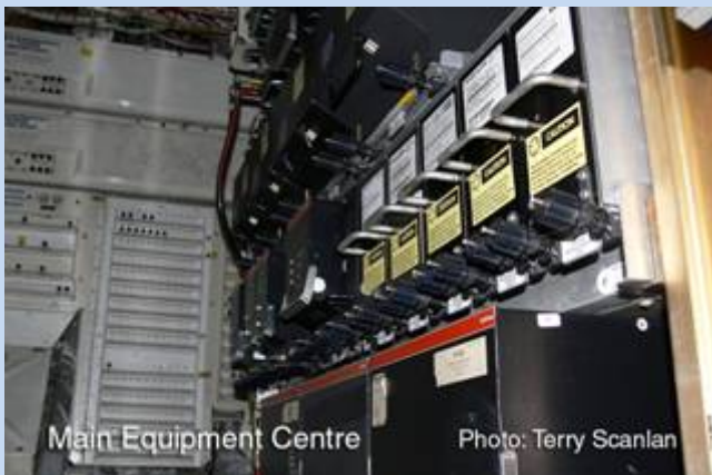
Main Equipment Centre

One of the areas that passengers don't normally get to see is the Main Equipment Centre where all the aircraft's computers are housed.