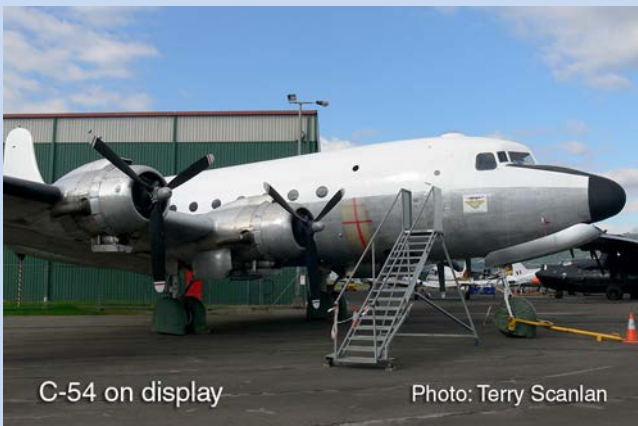
C-54 on display