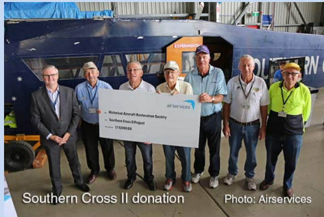
Southern Cross II donation