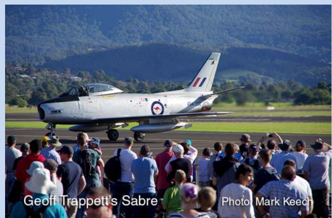
Geoff Trappett's Sabre