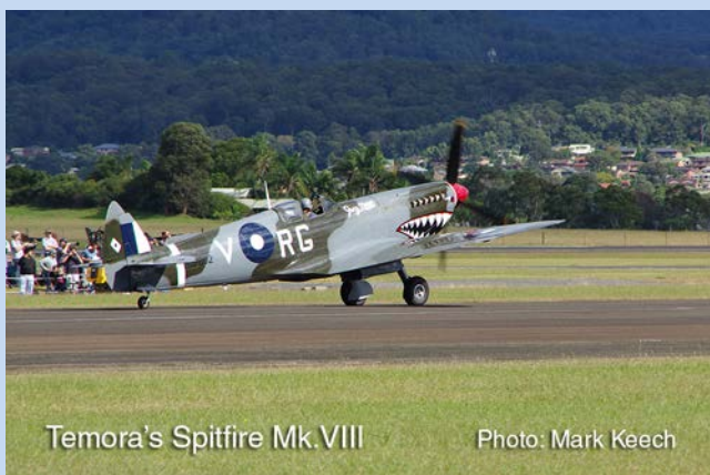
Temora's Spitfire Mk. VIII