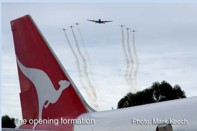
The opening formation

Wings Over Illawarra opened on both days with a precision parachute jump by the Army's Red Berets from the HARS Caribou followed closely by Connie flying over in formation with the RAAF Roulettes. After the Roulettes broke away Connie executed several low passes which impressed the crowds. Almost equally impressive was the Caribou's demonstration of its short field landing and takeoff capabilities.