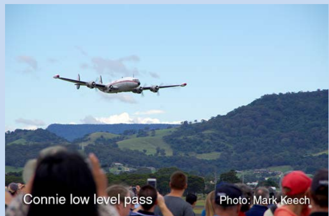
Connie low level pass