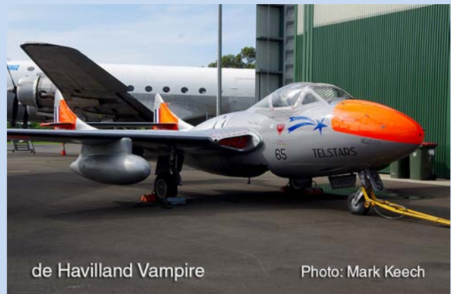
de Havilland Vampire