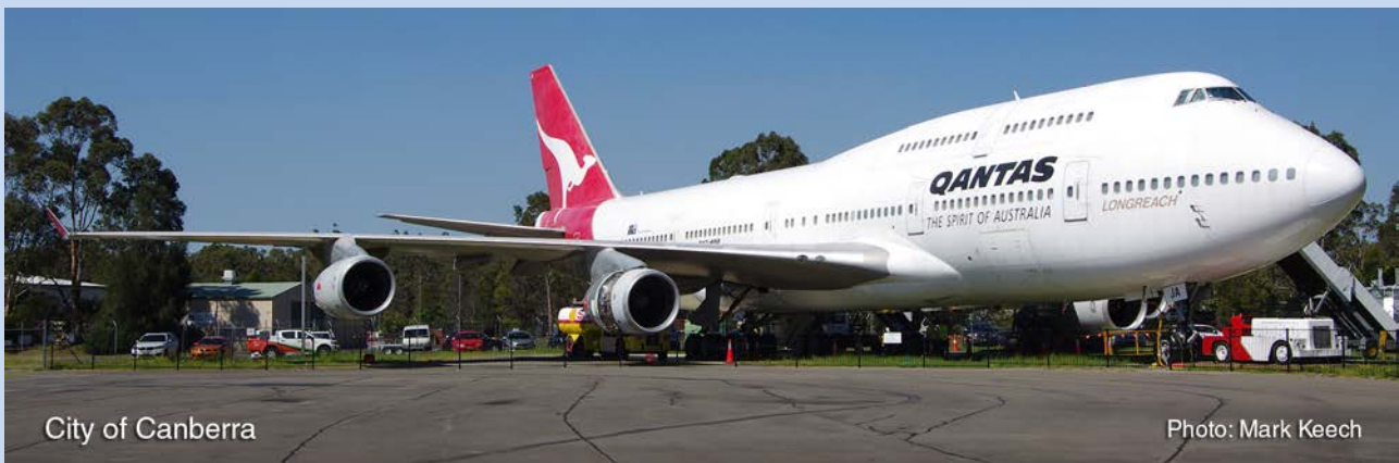
City of Canberra

The HARS volunteers who conduct this tour are either current or retired pilots, engineers and cabin crew who have worked on the 747. Therefore you can be assured your tour will not only be informative, but also include some amusing stories about the aircraft and its operations.