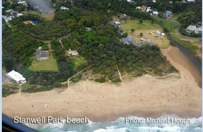
Stanwell Park beach