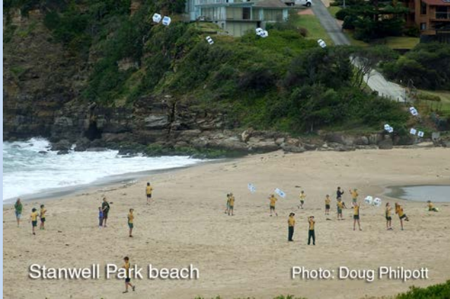
Stanwell Park beach

Our Catalina, Caribou and Dakota aircraft made the annual flyover during the event, thrilling the crowds as they flew low level along the beach. A HARS representative provided commentary about the aircraft as they approached Stanwell Park.