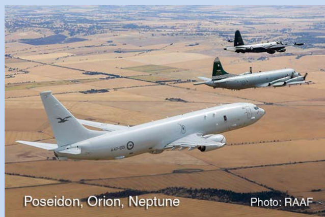
Poseidon, Orion, Neptune

The Poseidon is a purpose-built maritime patrol aircraft based on the Boeing 737-800 but structurally modified to carry a range of internal and external weapons and to allow sustained operations at low level. It replaces the Lockheed AP-3C Orion which will be phased out over the next three years. The complete fleet of 12 Poseidon aircraft will be in place by 2020 and will be based at RAAF Edinburgh.