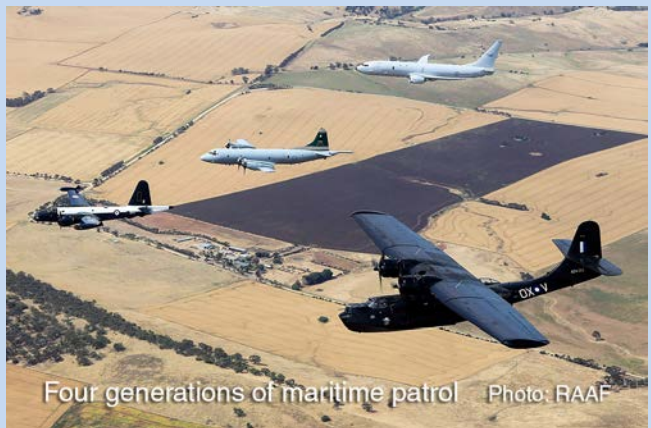
Four generations of maritime patrol

The Poseidon is a purpose-built maritime patrol aircraft based on the Boeing 737-800 but structurally modified to carry a range of internal and external weapons and to allow sustained operations at low level. It replaces the Lockheed AP-3C Orion which will be phased out over the next three years. The complete fleet of 12 Poseidon aircraft will be in place by 2020 and will be based at RAAF Edinburgh.