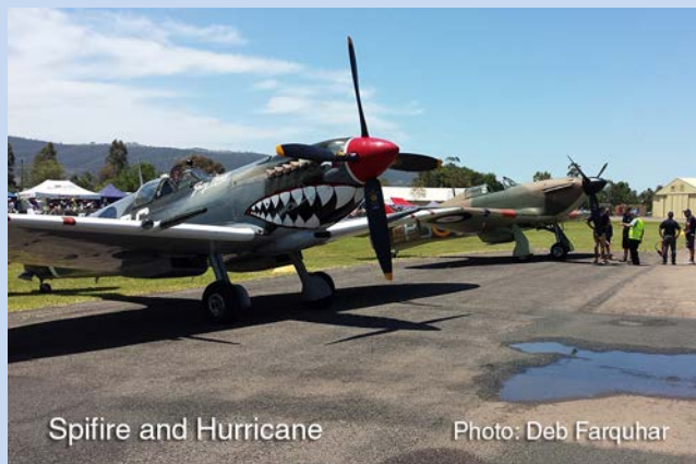
Spitfire and Hurricane

On Saturday 19 November our DHC-4 Caribou aircraft flew to Scone with several HARS members to witness the first flight of a magnificently restored WWII Hawker Hurricane fighter aircraft. The HARS aircraft formed part of a display of Australian warbirds which included a Supermarine Spitfire Mk.VIII and a CAC Wirraway.