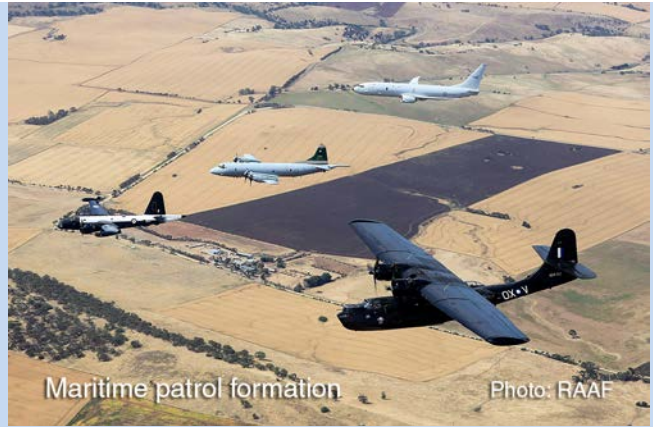
Maritime patrol formation