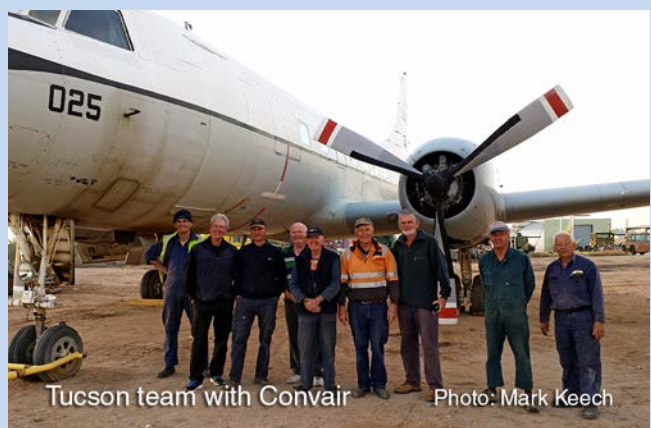
Tucson team with Convair