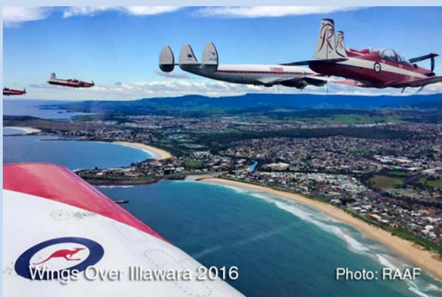
Wings Over Illawarra 2016