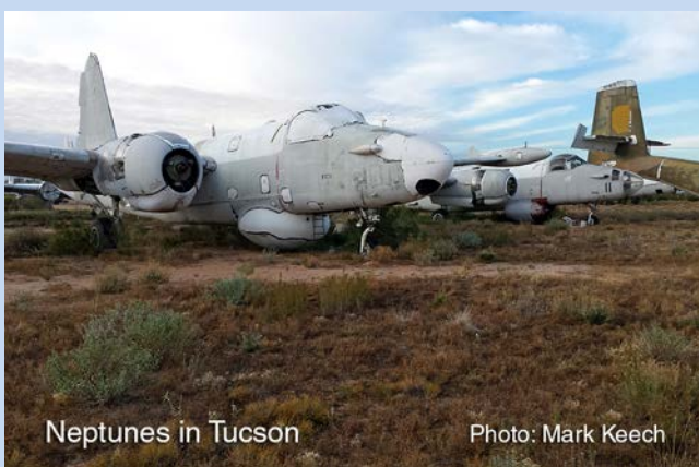
Neptunes in Tucson

The HARS team are extremely grateful for the warm welcome and generous support of the staff at Pima Air and Space Museum. If you're ever in Arizona it is definitely worth a visit: www.pimaair.org