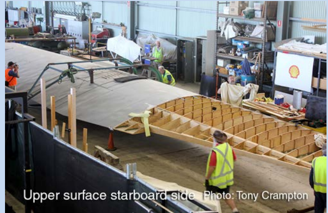
Upper surface starboard side