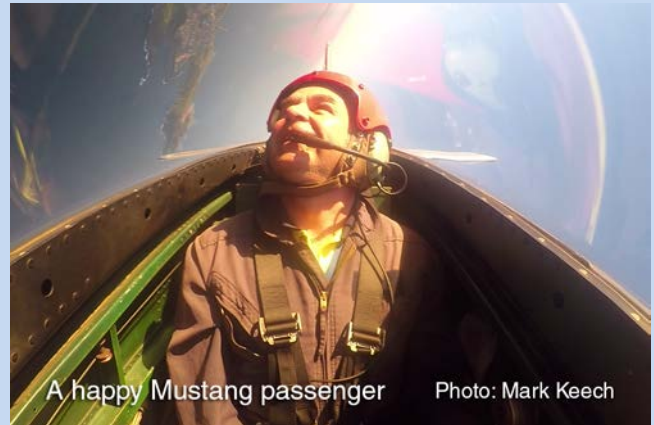
A happy Mustang passenger