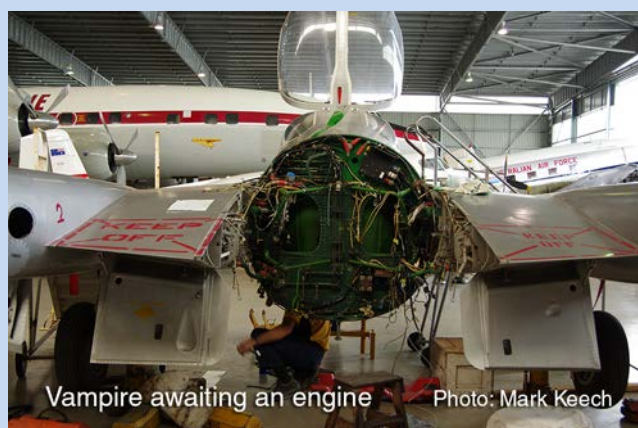
Vampire awaiting an engine