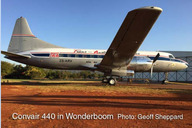
Convair 440 in Wonderboom

As you may already know, HARS has acquired a Convair 440. Currently located at Wonderboom in South Africa, the aircraft is being readied for a ferry flight back to Australia. For the last month, several HARS pilots have been in South Africa being trained and licensed on the aircraft as well as attending to all the necessary paperwork and formalities to enable the ferry flight to proceed. They had hoped to be ferrying the aircraft to Wollongong over the next weeks but unfortunately, due to a lack of sufficient quantities of fuel in the Seychelles the ferry flight has been postponed. The Convair has been painted in Trans-Australia Airlines colour scheme and will be a spectacular addition to the HARS collection.