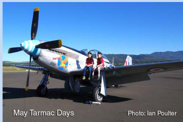
May Tarmac Days

Some Air Cadets from Canberra were also in attendance. They received something of a treat by having their photos taken on sitting on the wing of the CA-18 Mustang.