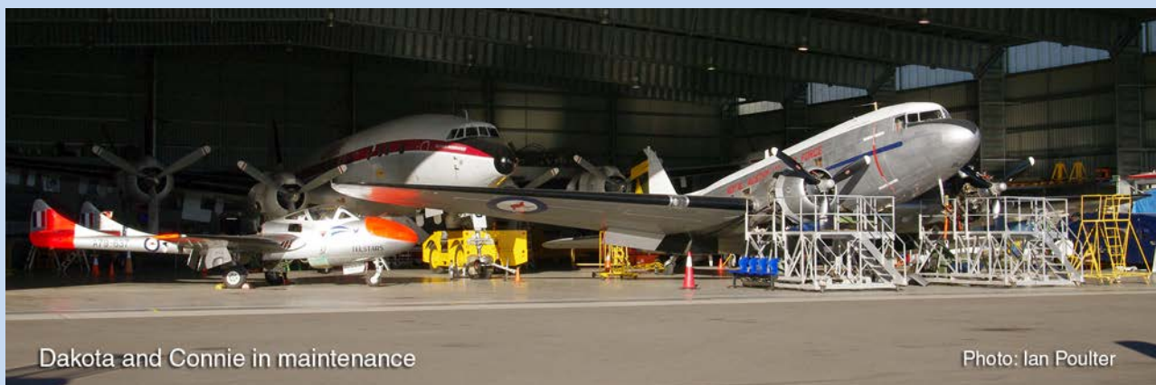
Dakota and Connie in maintenance

Our flying C-47B, serial A65-94 entered annual maintenance in late April, with the operation progressing on schedule. Also entering annual maintenance is our Super Constellation. Connie enthralled the crowds at Wings Over Illawarra in late April, but now it is in for its routine annual maintenance.