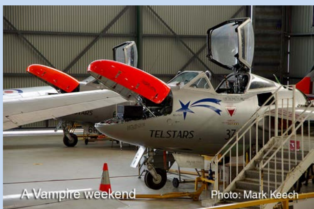
A Vampire weekend

Work continues on our two ex RAAF Vampires, A79-637 and A79-665. Airframe 665 is largely complete. This aircraft, although it will not fly, now has a working de Havilland Goblin 35 engine and is able to conduct limited taxi runs. Airframe 637 is being returned to flying condition although the estimated timing of first flight is yet to be determined. The Vampire was originally designed in England during World War II but didn't enter service with the RAF until 1946. Our aircraft were built in Australia at de Havilland's Bankstown factory. They were operated by the RAAF through the 1950's and early 1960's mostly in the role of jet trainers.