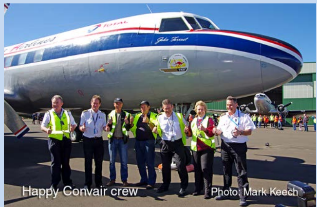
Happy Convair crew