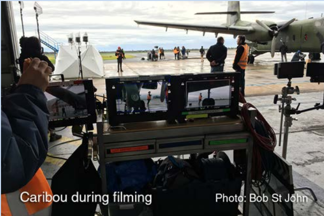
Caribou during filming

Following two days of filming, the Caribou departed Avalon on Tuesday morning and stopped at Essendon for fuel before proceeding to Wollongong for an afternoon arrival.