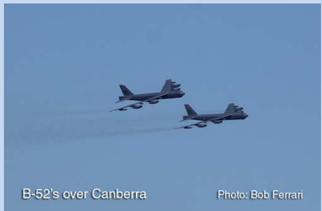
B-52's over Canberra