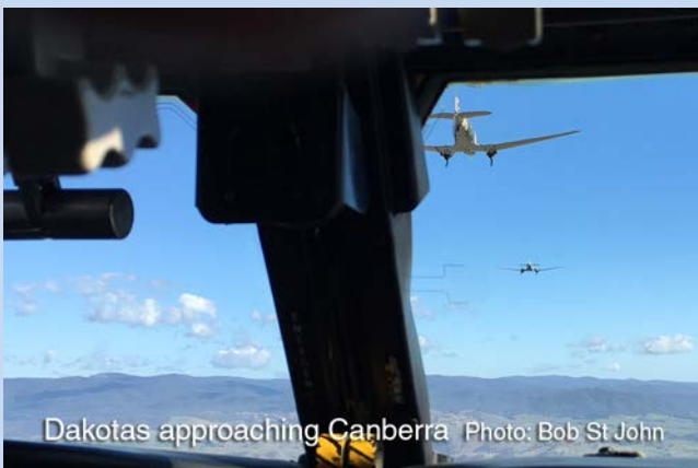
Dakotas approaching Canberra

After returning to Wollongong, one of our Caribous then departed for an additional flyover of the afternoon service at Moss Vale.