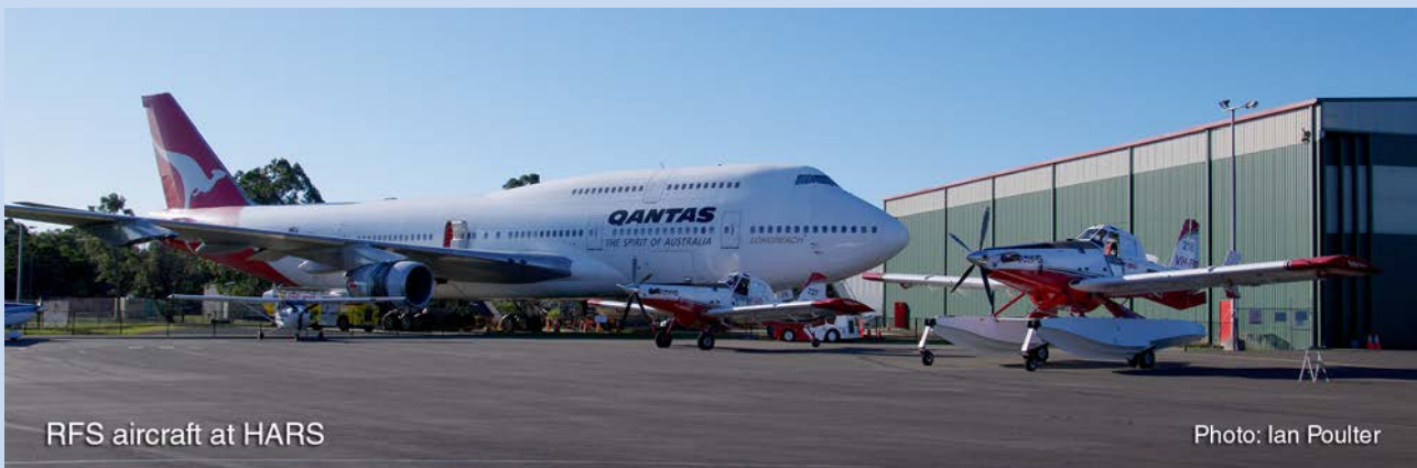
RFS aircraft at HARS

The August tarmac days were enhanced by some unusual activity at Illawarra Regional Airport. The NSW Rural Fire Service (RFS) were conducting training on the Friday and Saturday of the weekend meaning HARS had less tarmac area available. The big upside was that there were numerous RFS aircraft, both fixed and rotary wing, flying throughout the day. One unique aircraft was an Air Tractor AT-802 Fire Boss fitted with floats to provide amphibious capability.