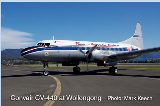
Convair CV-440 at Wollongong

The Convair is beautifully presented in the traditional Trans Australia Airlines livery consistent with its age. HARS now has two aircraft in TAA colours, the other being TAA's first aircraft, DC-3, VH-AES, Hawdon.