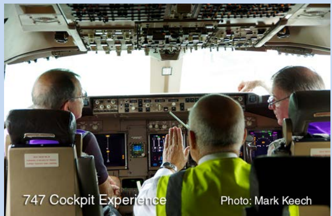
747 Cockpit Experience