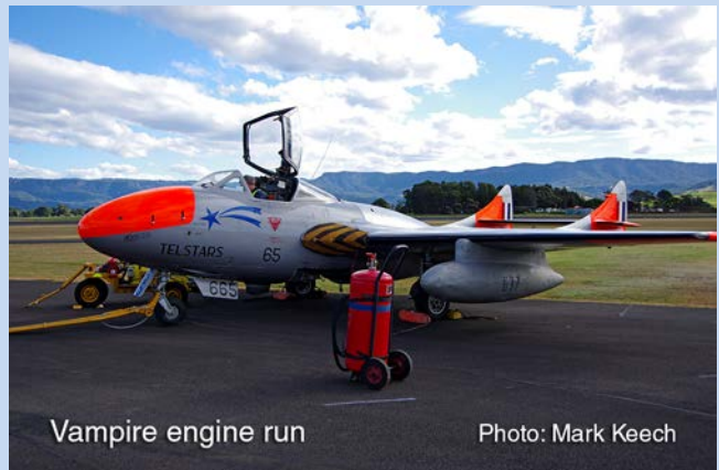
Vampire engine run