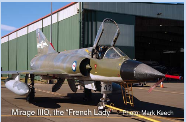
Mirage III(F), the "French Lady"