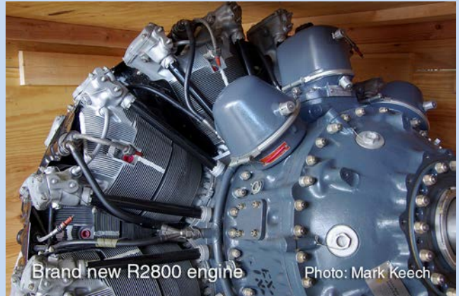
Brand new R2800 engine