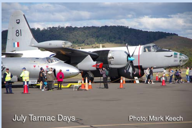
July Tarmac Days

The de Havilland T.35 Vampire A79-665 was rolled out to conduct some very satisfying engine runs on each of the Tarmac Days. In addition the RAAF Lockheed AP3-C Orion and our Douglas C-54E Skymaster were positioned onto the tarmac on Sunday.