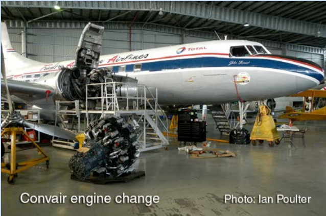
Convair engine change

Earlier this year our Convair CV-440 experienced mechanical issues with the right engine. Upon inspection it was decided an engine change was required. A fully reconditioned engine was sourced from the US and our engineers have now commenced work to remove the old engine and prepare the replacement engine for installation.