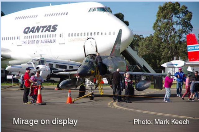
Mirage on display