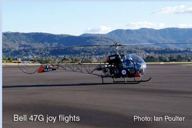
Bell 47G joy flights

The August Tarmac Days were made more interesting by the presence of a Bell 47G helicopter that was being offered for joy flights. Many of our visitors spontaneously took the opportunity to go for a ride in the beautifully restored helicopter and the crew were certainly busy throughout the weekend.