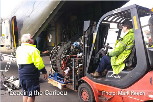
Loading the Caribou