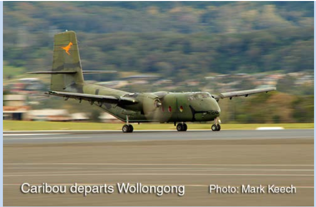
Caribou departs Wollongong