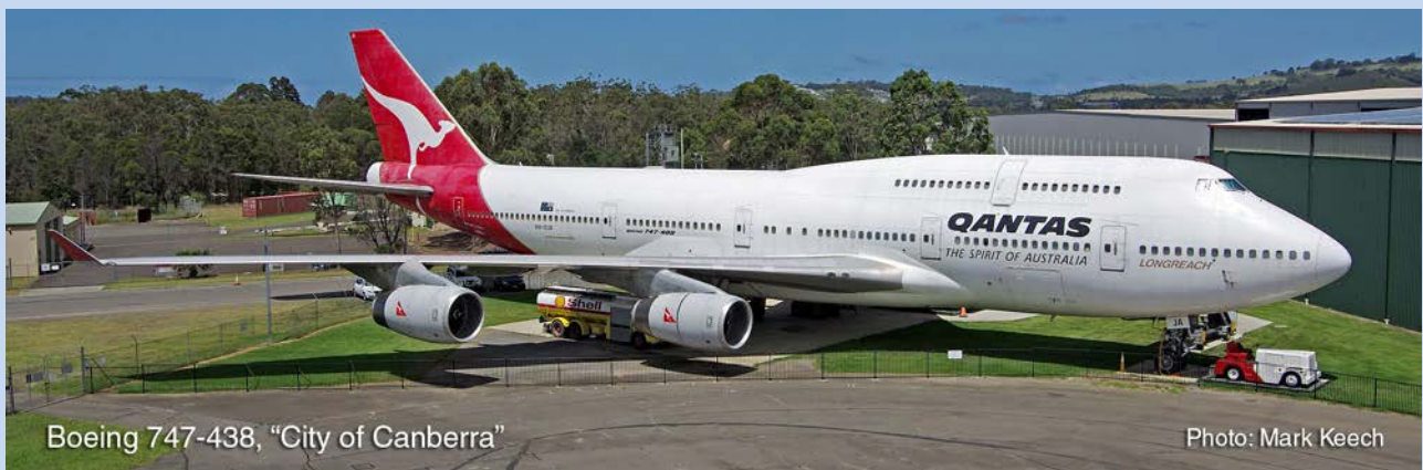
Boeing 747-438, "City of Canberra"

The 747 Premium Tours are very popular with our visitors from all over the World. For just $195 you can enjoy the complete 747 experience.