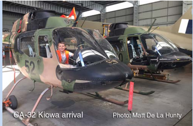
CA-32 Kiowa arrival