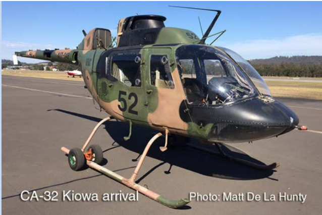
CA-32 Kiowa arrival