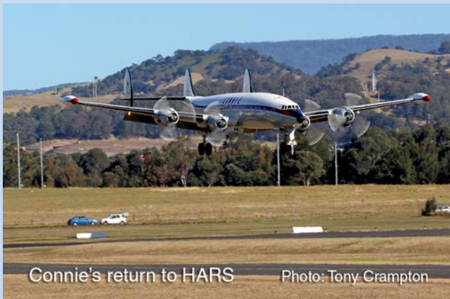
Connie's return to HARS

The return flight from Wagga Wagga took less than fifty minutes. Perhaps the shiny new paint scheme contributed by reducing the aircraft's drag!