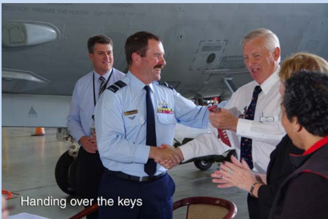
Handing over the keys