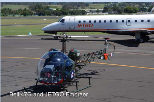
Bell 47G and JETGO Embraer

Visitors were able to see first-hand how much effort goes into polishing a DC-3! Guided tours of hangar three were also available throughout the weekend as well as joy flights in a Bell 47G helicopter and the first of our special 747 Wing Walks took place during the November Tarmac Days.