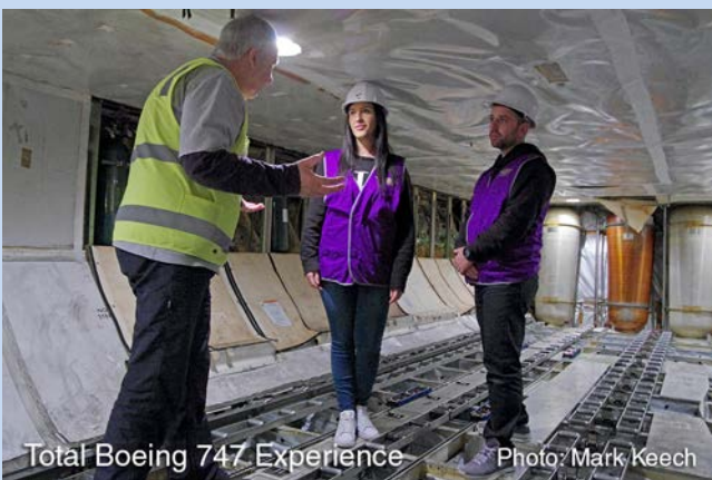
Total Boeing 747 Experience

Bookings are limited to two guests per tour. The cost is $100.00 per person and is payable at time of booking.