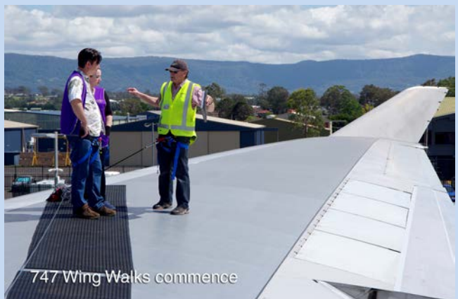
747 Wing Walks commence