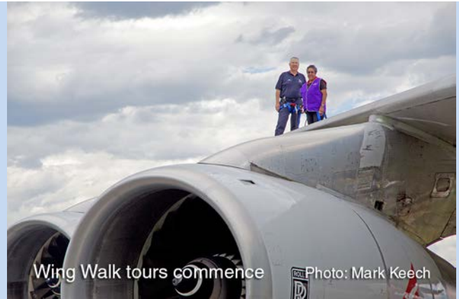
Wing Walk tours commence