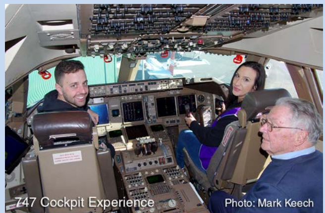
747 Cockpit Experience