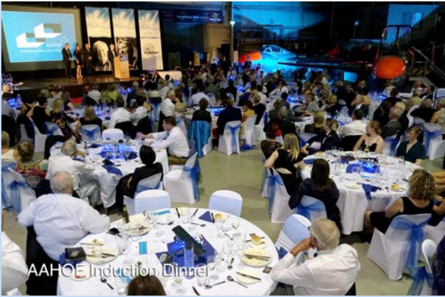
AAHOE Induction Dinner