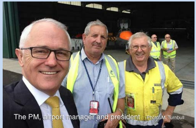
The PM, airport manager and president

The Prime Minister, Malcolm Turnbull visited HARS on Monday 27 November. Flying in Australia's Air Force One he had meetings in the Illawarra and had to pass through HARS to get to his car. After a subtle invitation to check the place out on his way back, he and his minders had an enjoyable few moments being shown around by our president (hmm, does president outrank prime minister?!)