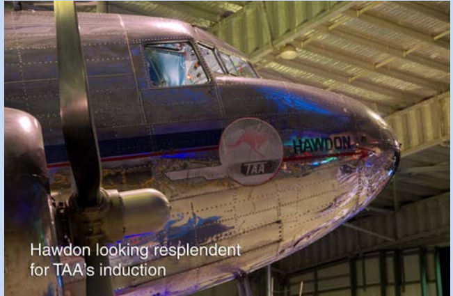
Hawdon looking resplendent for TAA's induction