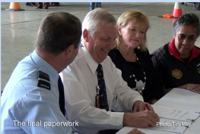
The final paperwork