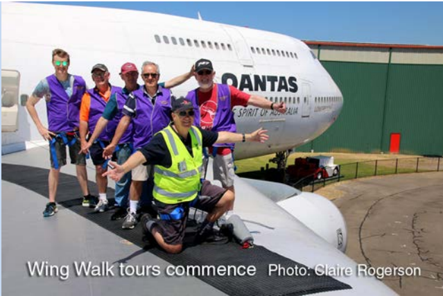
Wing Walk tours commence