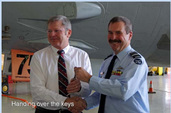
Handing over the keys