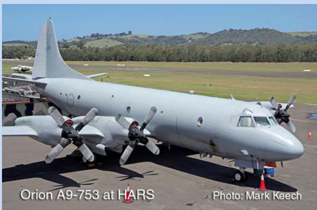
Orion A9-753 at HARS

The HARS AP-3C Orion, A9-753, has itself participated in overseas operations as well as searching for the lost MH370 airliner and many other very important security and historical events. The full history of this aircraft will eventually be disclosed and showcased at our HARS facility.