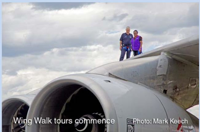
Wing Walk tours commence