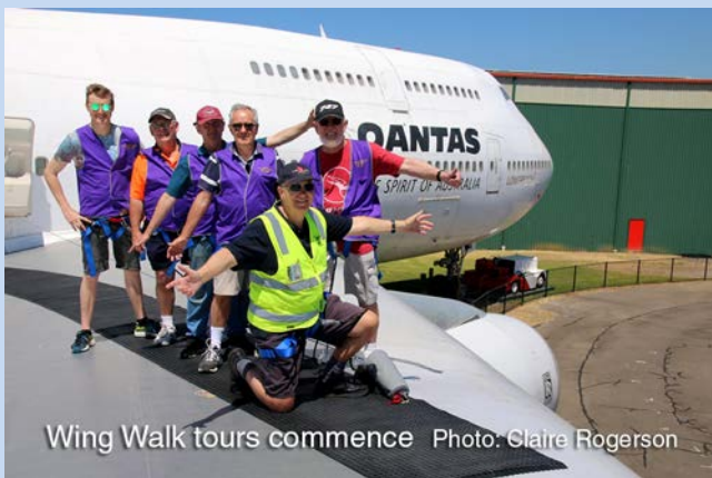
Wing Walk tours commence

Please note that fully enclosed, flat (no heels) footwear must be worn. Ladies must wear shorts or pants, please no skirts. This is to facilitate the fitting of a snug safety harness.