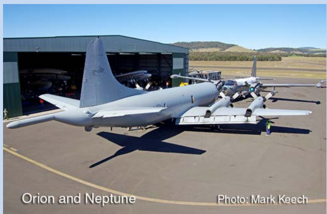
Orion and Neptune