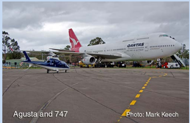
Agusta and 747