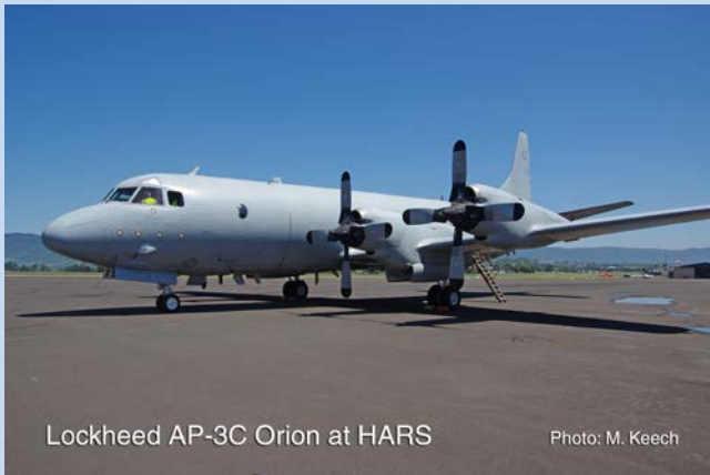
Lockheed AP-3C Orion at HARS