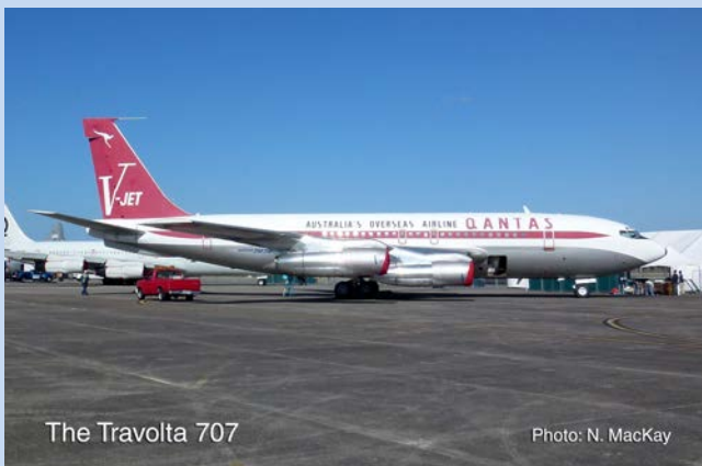
The Travolta 707

John Travolta has indicated his intention to be on the aircraft when it arrives at Illawarra Regional Airport. The arrival promises to be a massive event for HARS, the Illawarra and Australian aviation heritage and is sure to rival a major Hollywood event!