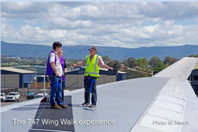
The 747 Wing Walk experience

Please note that fully enclosed, flat (no heels) footwear must be worn. Ladies must wear shorts or pants - please no skirts. This is to facilitate the fitting of a snug safety harness.