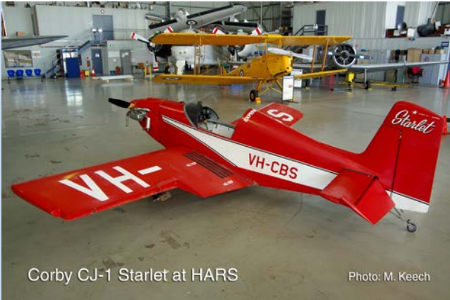
Corby CJ-1 Starlet at HARS