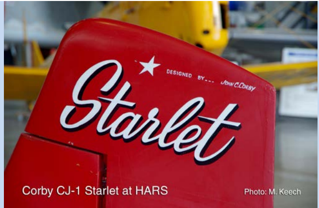
Corby CJ-1 Starlet at HARS