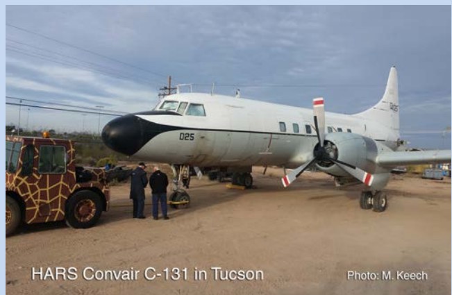
HARS Convair C-131 in Tucson