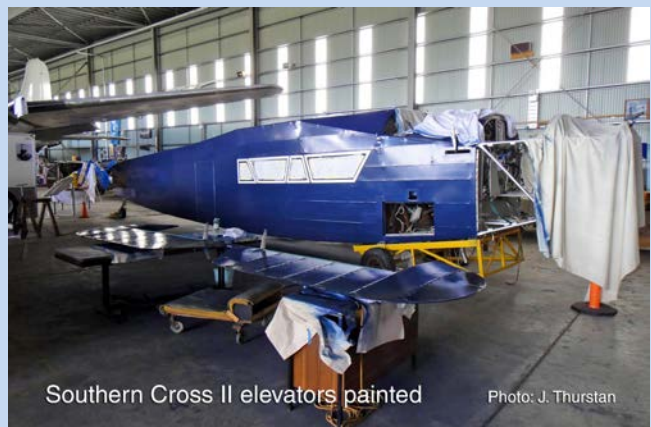
Southern Cross II elevators painted