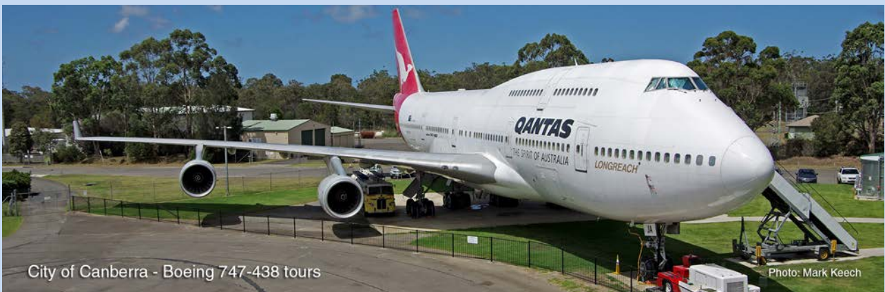
City of Canberra - Boeing 747-438 tours

Bookings are limited to two guests per tour. The cost is $100.00 per person and is payable at time of booking.