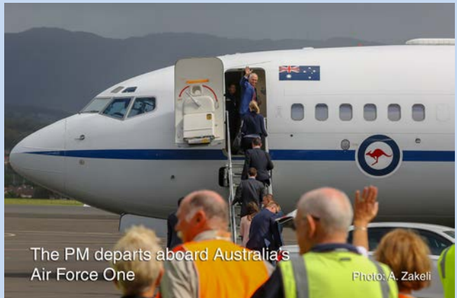
The PM departs aboard Australia's Air Force One