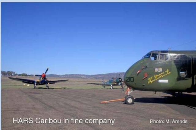
HARS Caribou in fine company

The Caribou was on display throughout the day and proved very popular with show attendees. After a busy day the flight home was very smooth, with arrival at Albion Park being very timely - just ahead of a gusty southerly front.