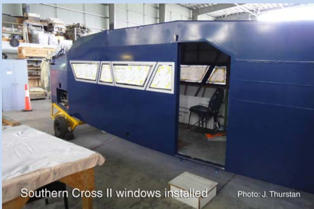
Southern Cross II windows installed

Milestones achieved in March include completion of the painting of the wing and elevators, installation of the windows and preparation of the horizontal stabilisers for painting.