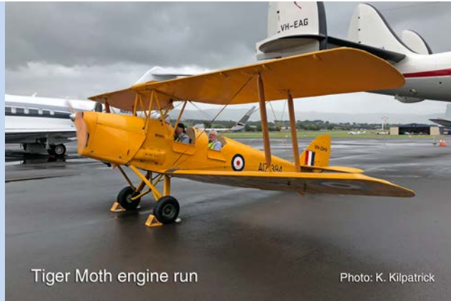
Tiger Moth engine run