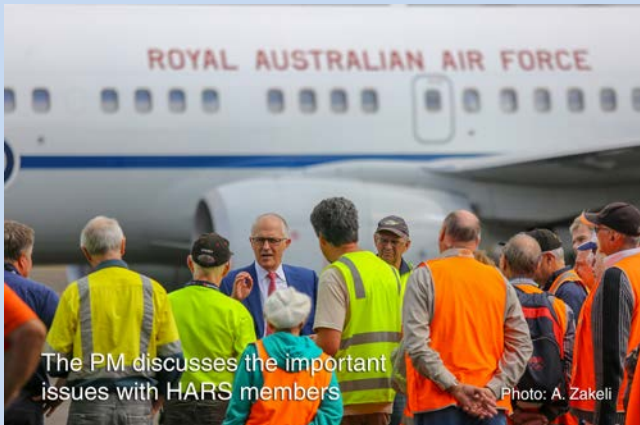
The PM discusses the important issues with HARS members

Following on from his visit in November last year, the Prime Minister, Malcolm Turnbull, visited HARS twice during March, passing through our facilities on his way to meetings in the Illawarra. On his last visit on 22 March, Mr Turnbull took time out from his schedule to chat with some of our HARS volunteers and find out a bit more about HARS Aviation Museum.