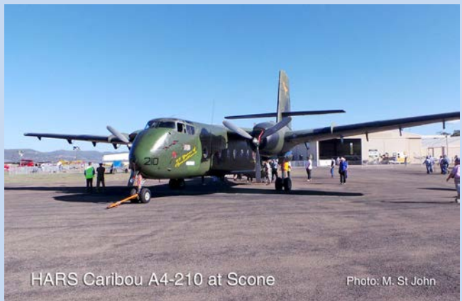
HARS Caribou A4-210 at Scone