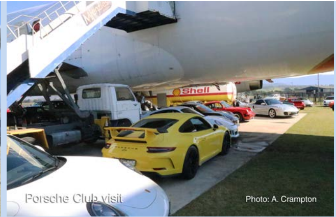
Porsche Club visit