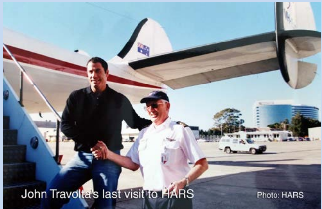
John Travolta's last visit to HARS