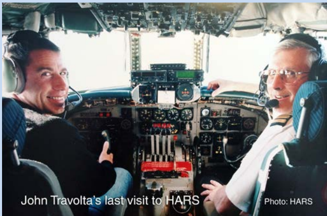
John Travolta's last visit to HARS

Given the many variables and the complexity of this project, it is still too early to predict the timing of the aircraft's arrival in Australia but watch this space.