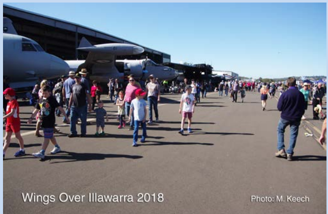
Wings Over Illawarra 2018