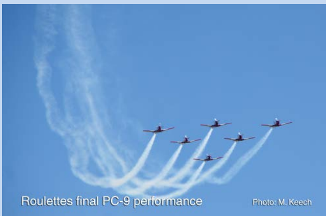
Roulettes final PC-9 performance

The weekend was an outstanding success for the organisers, the public and HARS Aviation Museum and there was a huge range of aircraft flying displays. The Royal Australian Air Force dominated the proceedings with displays from the F/A 18 Hornet, Hawk 127 and C-17 Globemaster III, the first ever airshow appearance of the P-8A Poseidon and the Roulettes in their final Wings Over Illawarra display with the Pilatus PC-9. Army Blackhawk and Navy Seahawk helicopters were also displayed as well as the MRH-90. Historic warbirds were well represented with a stunning formation of Merlin-engined fighters – the Hurricane, Spitfire and Mustang.