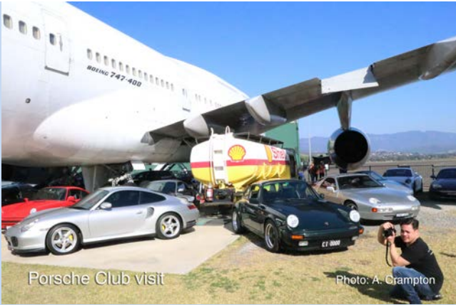
Porsche Club visit