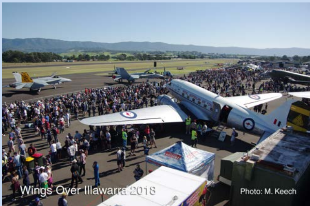
Wings Over Illawarra 2018

HARS Aviation Museum contributed by opening 14 aircraft for public inspection, including the perennial favourites, the Boeing 747-438 and the Lockheed C-121C Super Constellation. Over 12,000 people took the opportunity to inspect our aircraft!