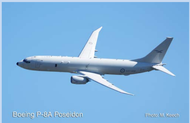
Boeing P-8A Poseidon