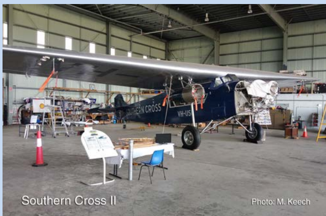
Southern Cross II

In late breaking news a major milestone was achieved in the Southern Cross II project today when the aircraft was placed on its main undercarriage. This year significant progress has been made on the project and to see the aircraft now standing on its wheels and looking very much like an aeroplane is very satisfying for the team. Congratulations to all involved!