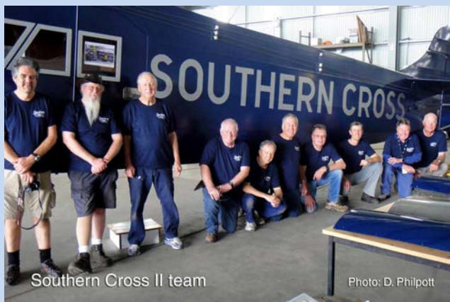
Southern Cross II team