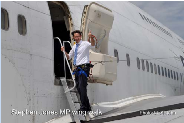
Stephen Jones MP wing walk