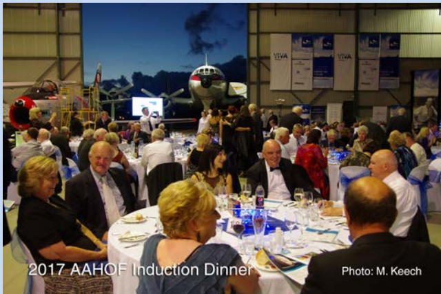
2017 AAHOF Induction Dinner

For more information about AAHOF see their website: www.aahof.com.au . Tickets for the AAHOF Induction Dinner can be purchased online at: www.trybooking.com/book/event?eid=412220 .