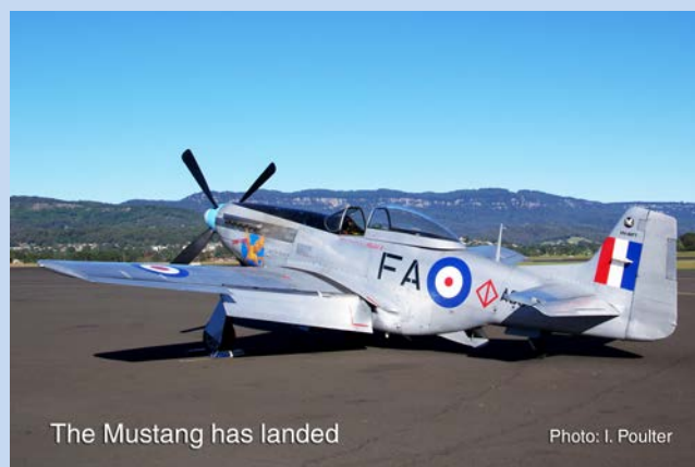
The Mustang has landed

Looking immaculate after a major overhaul, the Mustang is available for adventure flights throughout October and into November from our base here in Wollongong. For more information, or to make a booking visit www.mustangflights.com .