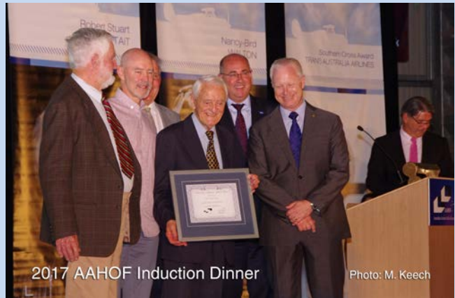
2017 AAHOF Induction Dinner