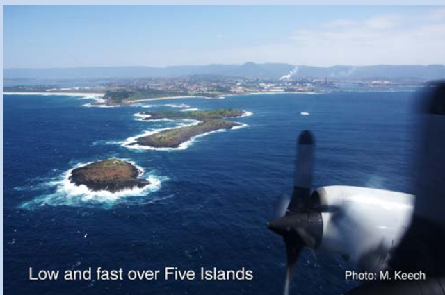
Low and fast over Five Islands

In RAAF service the aircraft was part of 92 Wing which included 10, 11, 292 and 492 Squadrons. Having flown over 16,000 hours, Orion A9-753, had participated in most RAAF P-3 operations including the search for the missing Malaysian Airlines Flight MH370, Operation GATEWAY and numerous deployments to the Middle East, including Iraq and Afghanistan. The aircraft was delivered to the RAAF on 4 August 1978, having been built in May 1978.