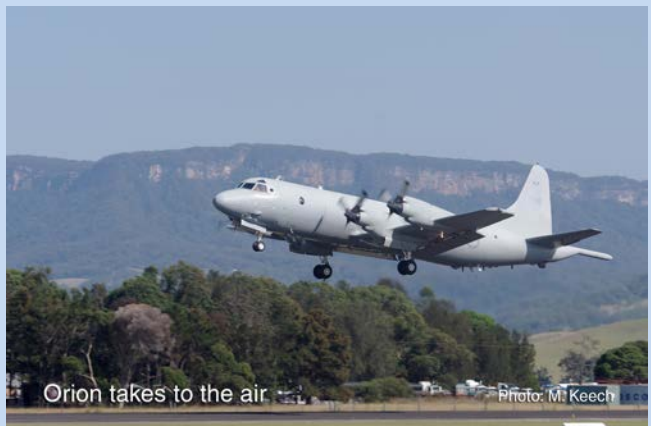
Orion takes to the air