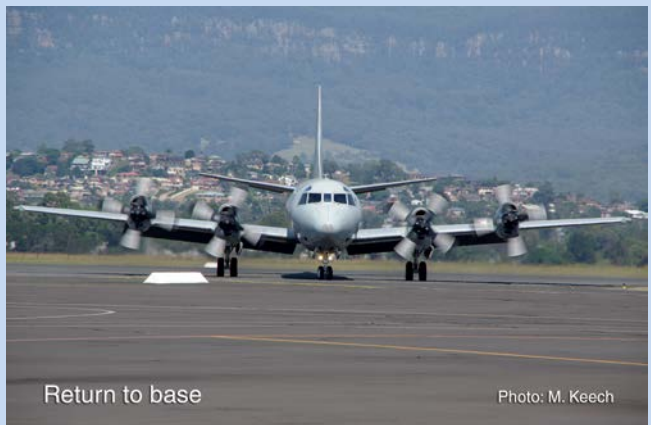
Return to base