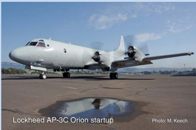
Lockheed AP-3C Orion startup

After more than 15 months of hard work, including aircraft systems testing, ex-RAAF Lockheed AP-3C Orion, A9-753, now registered VH-ORI, took to the sky on Wednesday 6 March as the newest aircraft type to fly in the HARS fleet! The aircraft, which has been onsite at Illawarra Regional Airport since December 2016, was officially handed over to HARS by the Chief of Air Force in November 2017 and the various teams have put in extraordinary efforts to obtain all of the approvals necessary to operate and maintain it in the civilian, limited category. Indeed, this may be the first time that a current military aircraft has been allowed to be operated in the civilian arena. Argentina, Brazil, Chile, Japan, New Zealand and Norway are among the current military operators of the type.