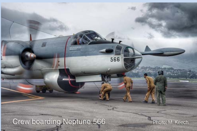
Crew boarding Neptune 566

The Dassault Falcon 200 Guardian maritime surveillance aircraft was developed for the French Marine from the Falcon 20, a modified version of the Mystère / Falcon 20 business jet. Squadron 25F operates the Guardian from its base in Tahiti.