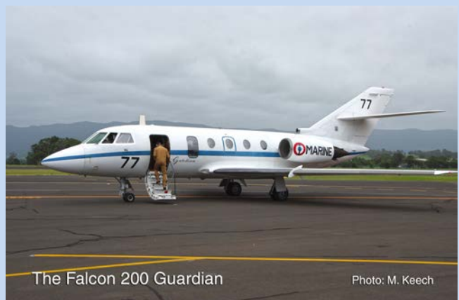
The Falcon 200 Guardian