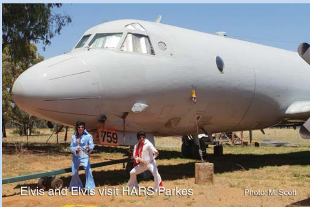
Elvis and Elvis visit HARS Parkes

The Parkes Elvis festival was held from January 9 to 13 to celebrate the music of Elvis Presley. HARS Aviation Museum Parkes was open on all days of the festival. For those who were “Elvised out”, a visit to the museum was no doubt a bit of a relief.