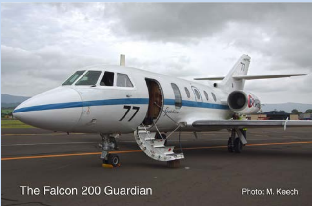
The Falcon 200 Guardian

On Saturday 19 January a Falcon 200 Guardian aircraft from French Marine Squadron 25F, with its crew, visited HARS. The crew took the opportunity to inspect one of the French Marine's former maritime surveillance aircraft, the Lockheed P2V-7 Neptune, 566, now operated by HARS.