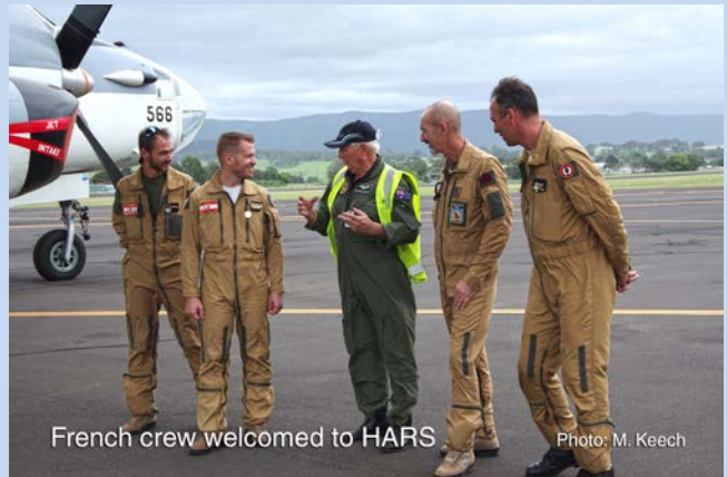
French crew welcomed to HARS