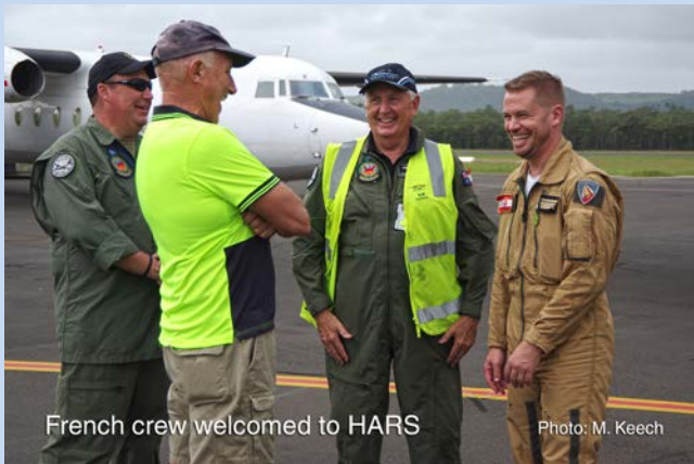
French crew welcomed to HARS