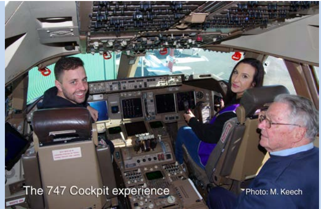
The 747 Cockpit experience