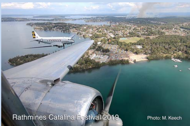
Rathmines Catalina Festival 2019