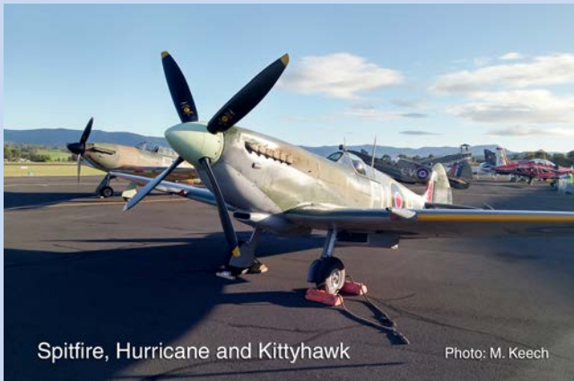
Spitfire, Hurricane and Kittyhawk

HARS was represented in the flying displays by a Douglas C-47B Dakota and a de Havilland DHC-4 Caribou, with some people saying that the Caribou outperformed its replacement, the C-27J Spartan! This year 16 HARS aircraft, including the 747, were open for public display free of charge and this proved very popular with the crowds, particularly when the rain set in on the Sunday.