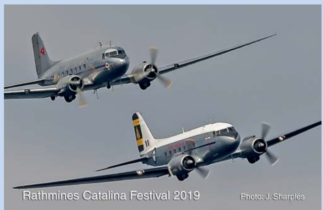
Rathmines Catalina Festival 2019