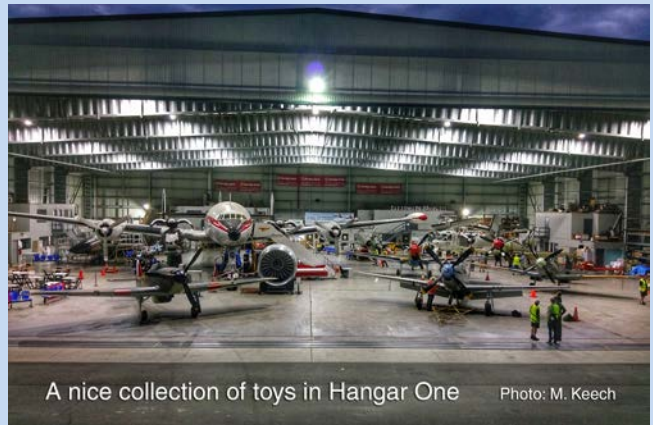
A nice collection of toys in Hangar One