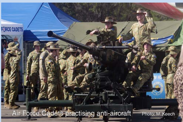
Air Force Cadets practising anti-aircraft

As well as the PC-21s the RAAF displayed a C-17A Globemaster, a C-27J Spartan, a C-130J Hercules and a P-8A Poseidon. World War 2 warbirds included a formation of Spitfire, Hurricane, Kittyhawk and Mustang, the Hawker Hurricane being a type that has never been seen at Illawarra Regional Airport before. A Wirraway, a Harvard and an Avenger also represented the WW2 era.