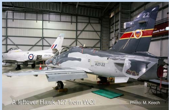
A leftover Hawk 127 from WOI