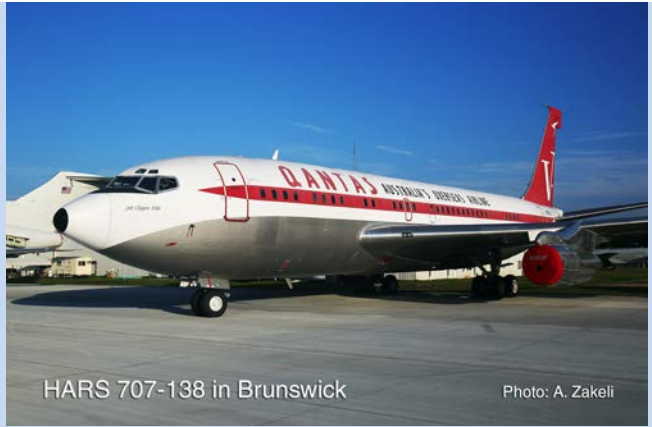
HARS 707-138 in Brunswick