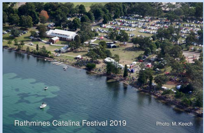
Rathmines Catalina Festival 2019