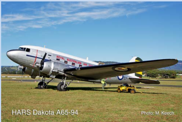
HARS Dakota A65-94