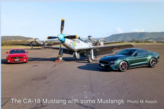
The CA-18 Mustang with some Mustangs

A BAE Systems Hawk 127 of the RAAF is still present and on display in Hangar One at HARS Aviation Museum and is likely to remain there for some weeks. Come and check it out! The CA-18 Mustang is also still on display and is available for adventure flights. For information contact Mustang Flights, www.mustangflights.com