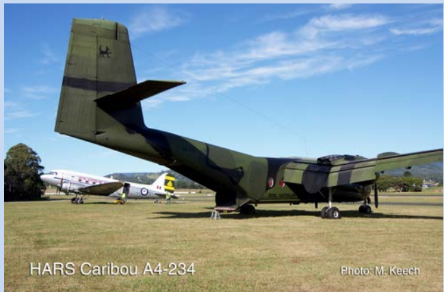
HARS Caribou A4-234