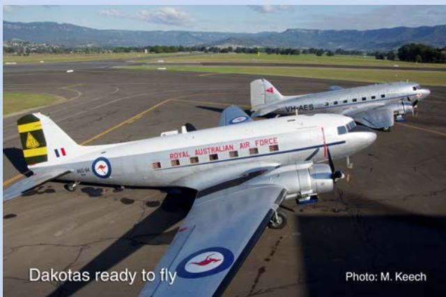
Dakotas ready to fly

During World War 2 the RAAF had a flying boat base at Rathmines, NSW. Located on the western shore of Lake Macquarie. The base was the largest RAAF flying boat facility and was home to over 3,000 personnel. Every year the Rathmines Catalina Memorial Park Association puts on an airshow to raise money for the restoration of their PB-Y-5A Catalina, a project that HARS Aviation Museum supports.