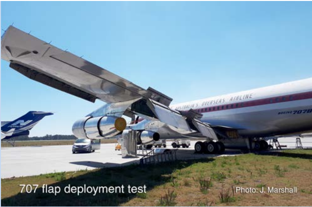
707 flap deployment test