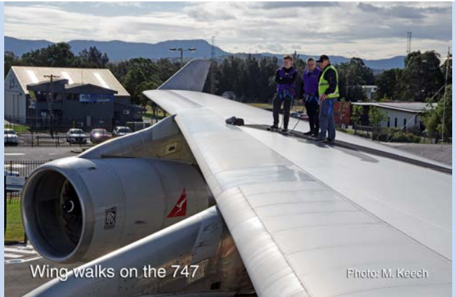
Wing walks on the 747