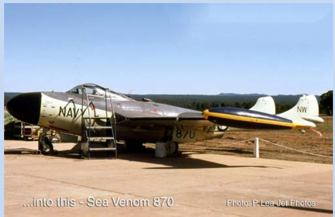
...into this - Sea Venom 870