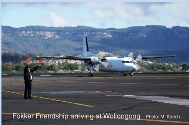
Fokker Friendship arriving at Wollongong

Now registered VH-TQN, the aircraft was retired from NZ Post in 2017 and donated to HARS Aviation Museum where she will join her sister ship, VH-EWH, which has been on display at Illawarra Regional Airport for almost a year. Our intention is to re-paint the two aircraft in the liveries of two of the Australian airlines that operated them and then maintain them in airworthy condition as part of Australia's aviation heritage, with one of them being based at Parkes.