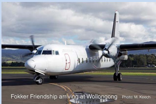
Fokker Friendship arriving at Wollongong

More than 80 Fokker Friendships once served with airlines across Australia from 1959, replacing the legendary DC-3 to provide vital links to the major cities for people in regional, rural and often remote areas. The high-wing aircraft, with its distinctive whistling, Rolls Royce Dart engines, were very popular as they flew many thousands of passengers around the nation over a 30-year period.