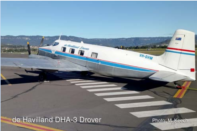
de Havilland DHA-3 Drover