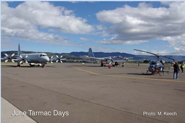
June Tarmac Days

Engines were run on a number of our aircraft as part of our regular maintenance program during the June tarmac days. Both of our ex-RAAF Dakotas, A65-94 and A65-95 were run as well as the Drover and, as a special treat, two generations of maritime patrol aircraft were fired up simultaneously. The French Neptune 566 was run at the same time as our AP-3C Orion.