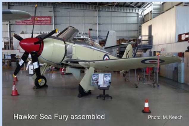
Hawker Sea Fury assembled

As previously reported the ex-RAN Hawker Sea Fury was transported from Nowra to Albion Park in April. Since then the aircraft has been reassembled to enable static display. The aircraft is currently just a shell with much work yet to be done on most of the internal systems and fittings. Over the coming months work on restoration will continue and will include an assessment of the potential to restore the aircraft to airworthy status.