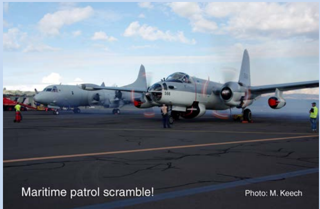
Maritime patrol scramble!