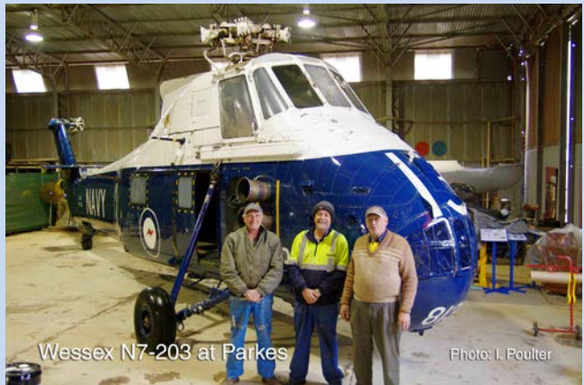
Wessex N7-203 at Parkes