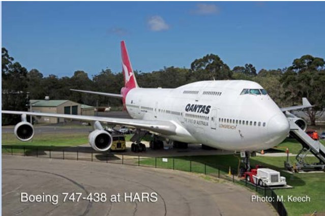
Boeing 747-438 at HARS