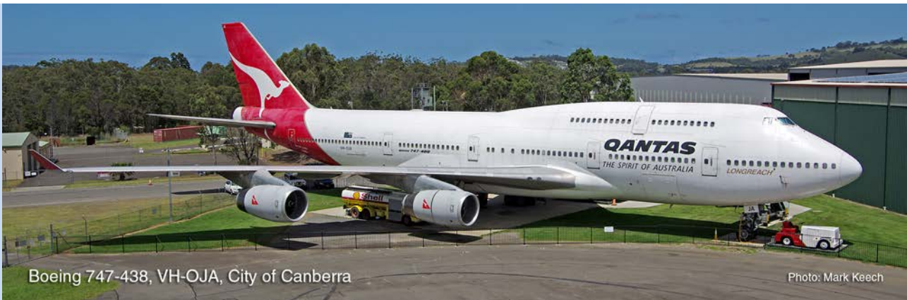
Boeing 747-438, VH-OJA, City of Canberra