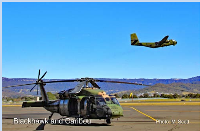
Blackhawk and Caribou