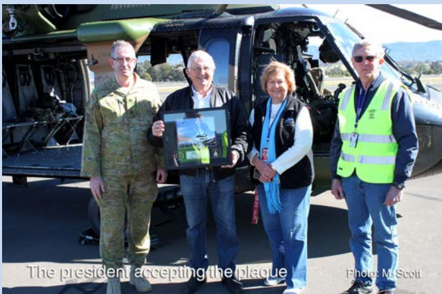
The president accepting the plaque