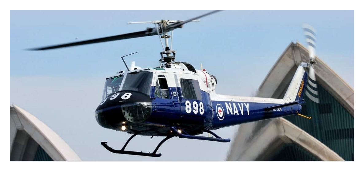
898 at the International Fleet Review Sydney Opera House October 2013.