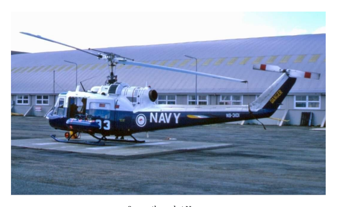
893\ on\ the\ pad\ at\ Nowra.

"As of last Friday (22 November 2019) the aircraft have been positioned in the new hangar and ready for maintenance.