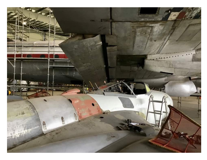
Sea Venom. Sunday 01 December 2019.

Sea Venom 870 continues to have incremental improvements with the addition of various parts in the cockpit. This past week work is being carried out on the canopy.