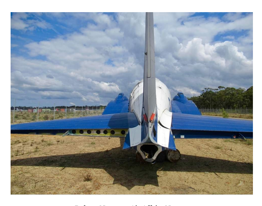
Dakota N2-90 at Air Affairs Nowra.

Dakota N2-90 remains in open secure storage at Air Affairs Nowra with its