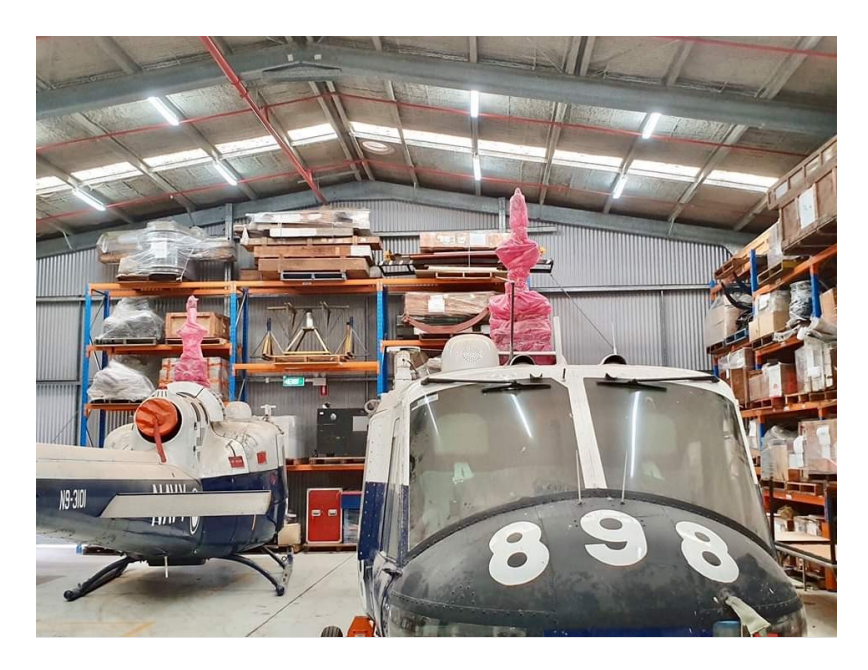
893 & 898 at Air Affairs, Nowra.

Iroquois 893 and 898 are hangared together in storage at Air Affairs Nowra.