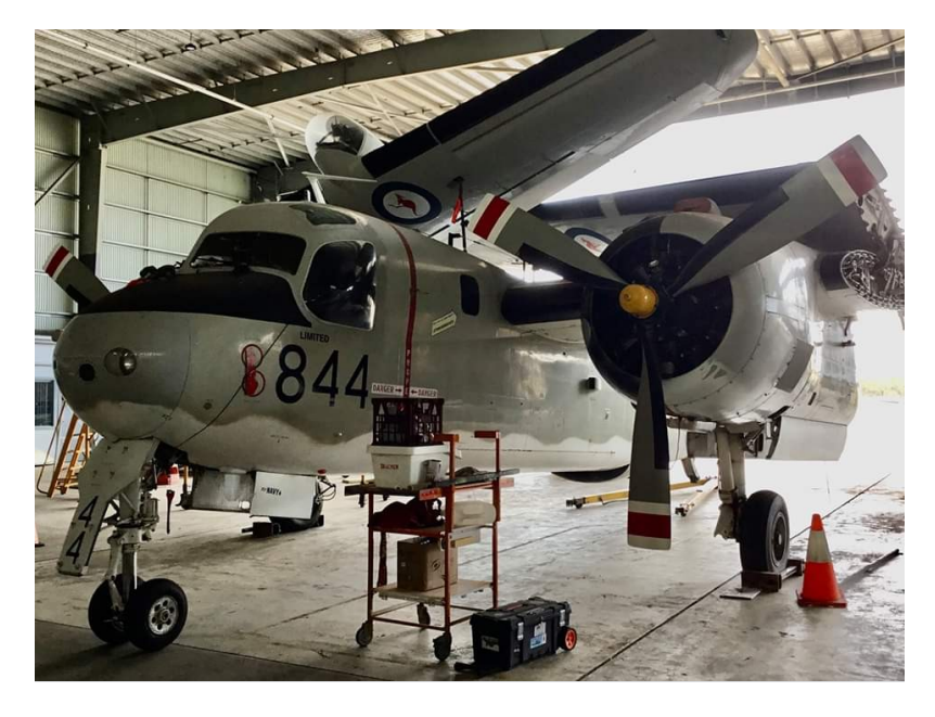
Tracker 844 at the eastern end of hangar #3 01 December 2019. Sperring.