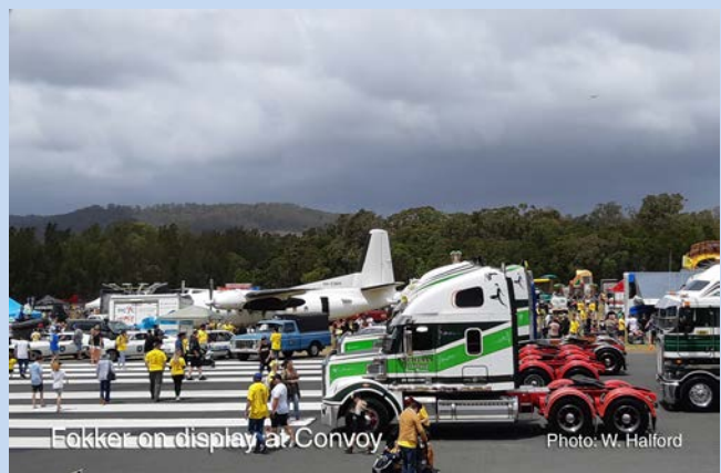
Fokker on display at Convoy