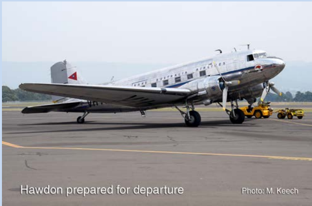
Hawdon prepared for departure

On the Saturday our visitors were treated to the sight and sound of our Douglas DC-3 'Hawdon' as it departed on a mission to Queensland for its sponsor. On the Sunday the Grumman S-2G Tracker performed a flight to support the annual Kite Day at Stanwell Park, home of Australian aviation pioneer Lawrence Hargrave. The Kite Day commemorates the 12 November 1894 flight by Hargrave using 4 box kites tethered together to lift him into the air.