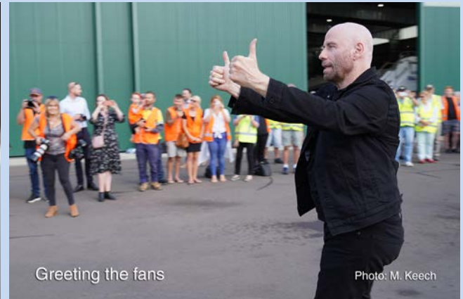
Greeting the fans