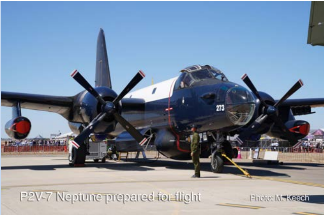
P2V-7 Neptune prepared for flight