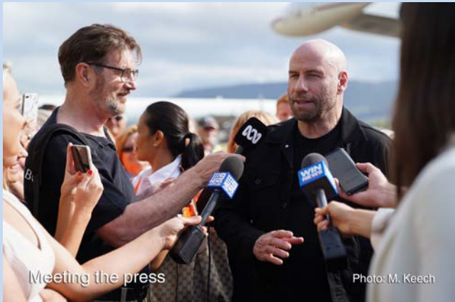
Meeting the press