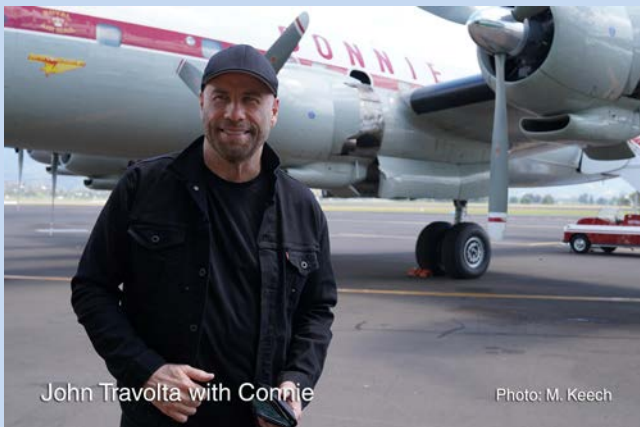
John Travolta with Connie

On 4 November John Travolta made a surprise visit to HARS! The American actor, singer and dancer, famous for his roles in Saturday Night Fever , Grease and Pulp Fiction , was in Australia for a tour of speaking engagements. He has had an interest in aviation since childhood and has been a friend of HARS for almost twenty years so it was a delight to welcome him back for another visit and a flight in our Lockheed Super Constellation, Connie .