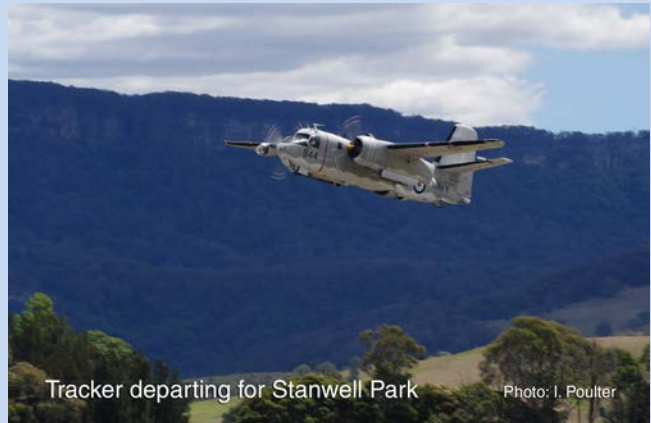
Tracker departing for Stanwell Park