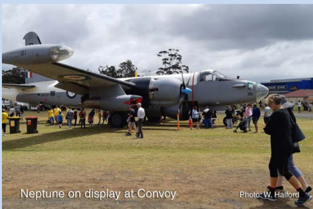
Neptune on display at Convoy

HARS Aviation Museum was represented at the post-Convoy family fun day at Shellharbour Airport, with one of our Fokker F-27's and our P2V-7 Neptune 281 on static display.