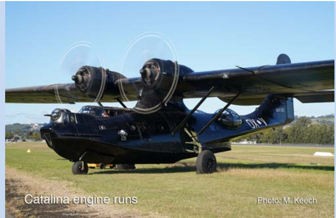
Catalina engine runs