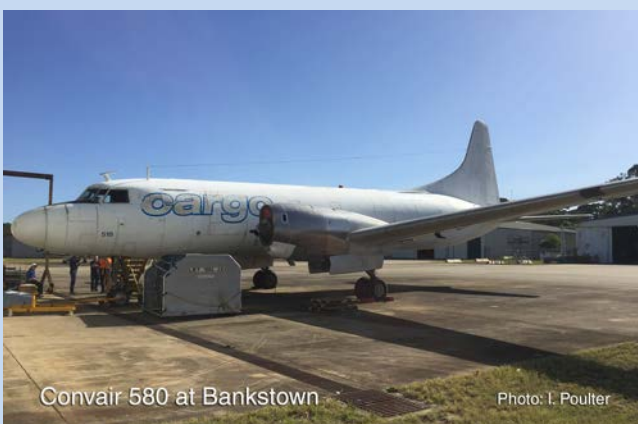
Convair 580 at Bankstown

In 2018 a collection of Convair CV-580s and associated spare parts were generously donated to HARS after being retired from freighter duties. At the time one of the Convairs was flown to Parkes to become part of our collection there and another one remained at Bankstown airport awaiting a decision on its fate. During the lockdown, a small group of HARS engineers inspected the Convair at Bankstown and decided that it was feasible to return it to airworthy status and work has now commenced on that project.