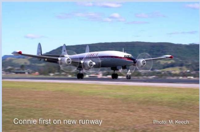
Connie first on new runway