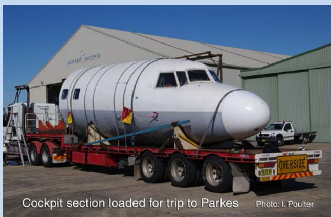
Cockpit section loaded for trip to Parkes