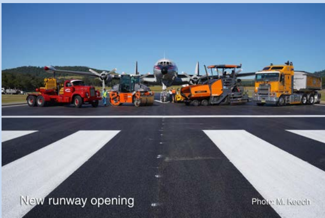
New runway opening

While there was not so much traffic at the airport over the last few months, Shellharbour Council took the opportunity to bring forward some long-planned maintenance work on the runways. The main runway, 16 / 34 was closed for a couple of weeks while it was re-surfaced at a cost of $2.5M. The new pavement comprises a stone mastic open graded asphalt surface which is considerably smoother than the previous surface and also has much better drainage.