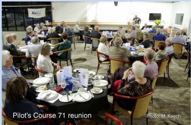
Pilot's Course 71 reunion