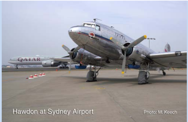
Hawdon at Sydney Airport