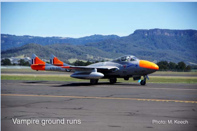
Vampire ground runs

Aircraft taking to the sky this month included one of our Caribous, which flew to South Australia to support a major Hollywood film production; our Grumman Tracker undertook some local flights and our Catalina and C-47 Dakota flew some circuits after completion of their annual inspections.