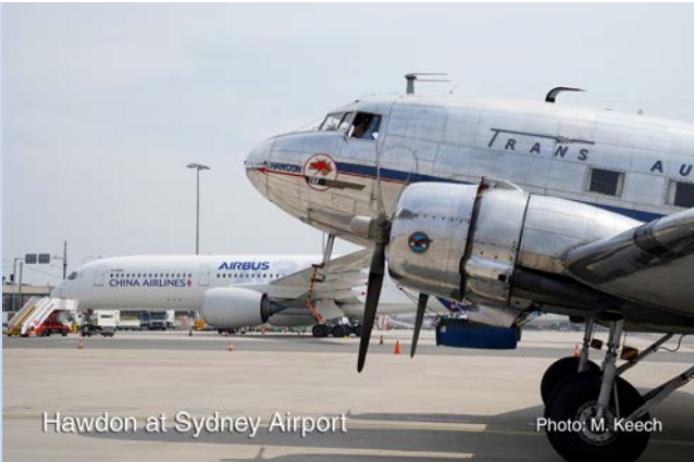
Hawdon at Sydney Airport