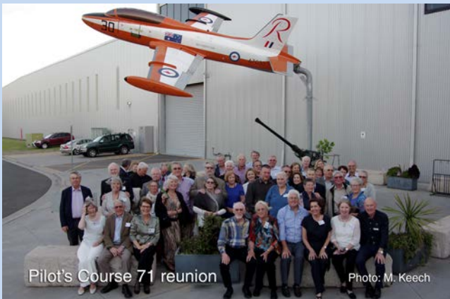
Pilot's Course 71 reunion

A reunion of the RAAF Pilot's training course No. 71 attendees was held at HARS over two nights on 18 and 19 October. An informal gathering was held in Hangar One on the Friday night as members of the group caught up in the presence of some of the fast jets that many of them went on to fly. Saturday saw the group return for a detailed tour of the museum followed by a formal dinner attended by over 50 of the original attendees and their families.