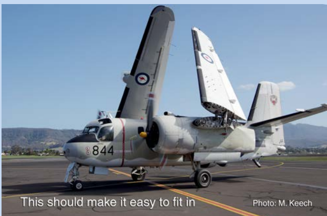
This should make it easy to fit in