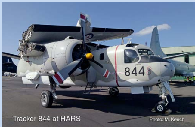
Tracker 844 at HARS