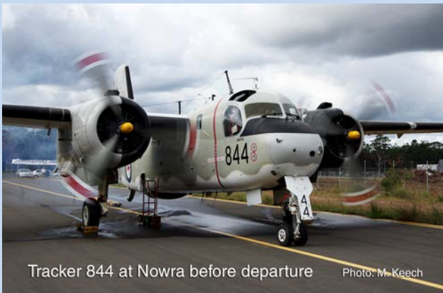
Tracker 844 at Nowra before departure

The Grumman S-2 Tracker was developed for the United States Navy after WWII. It was the first purpose built anti-submarine warfare aircraft for the USN and was introduced into service in 1952. Powered by two Wright R-1820 engines the Tracker was capable of carrying up to 2,200 kg of torpedoes and depth charges in its internal bomb bay and under-wing hard points.