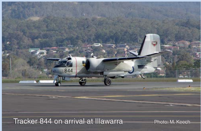
Tracker 844 on arrival at Illawarra