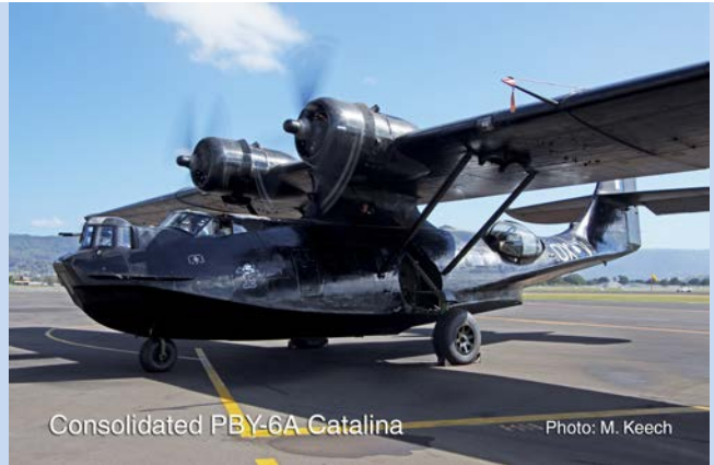
Consolidated PBY-6A Catalina