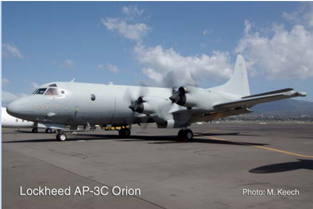
Lockheed AP-3C Orion