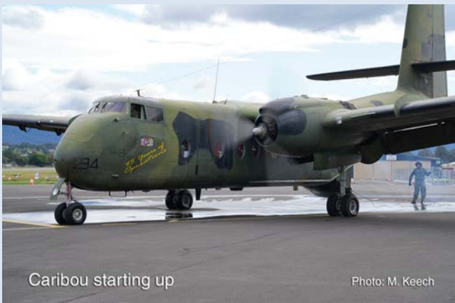
Caribou starting up