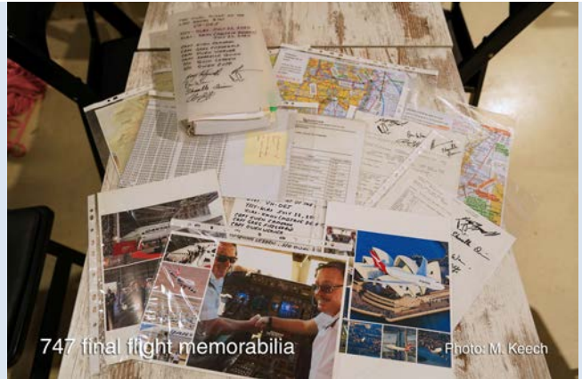
747 final flight memorabilia