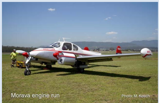
Morava engine run