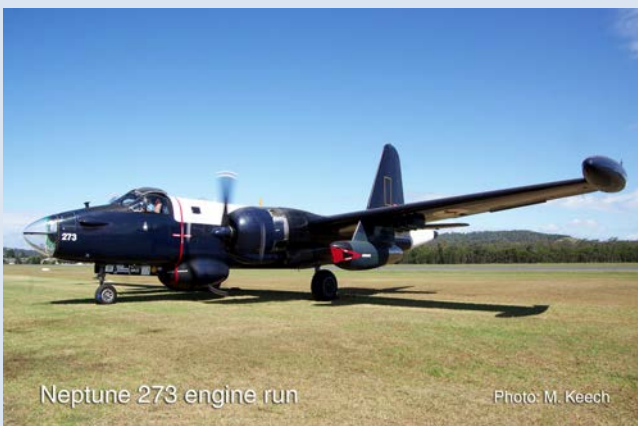
Neptune 273 engine run