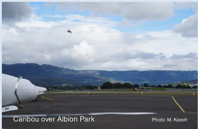
Caribou over Albion Park