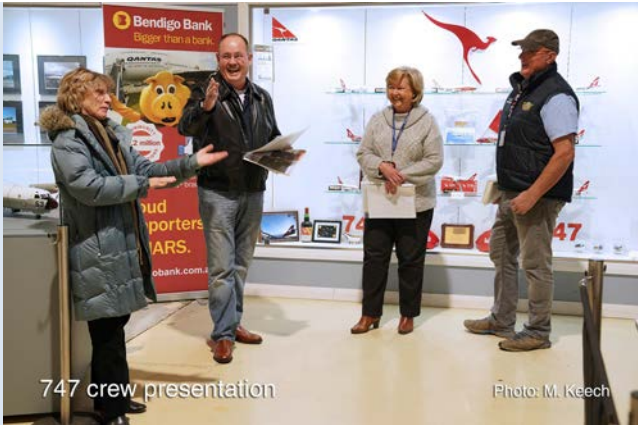
747 crew presentation