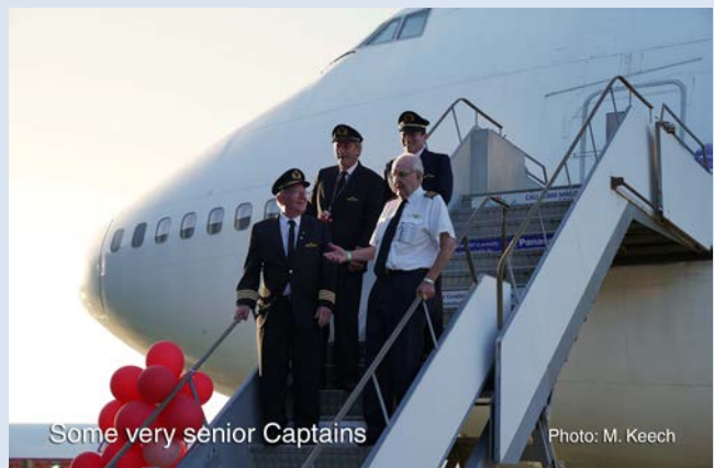
Some very senior Captains