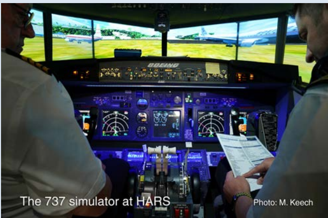
The 737 simulator at HARS

One simulator, a Boeing 737, was setup in Hangar One at HARS Shellharbour alongside a DHA-3 Drover, an aircraft used by the RFDS in its early days. The other simulator, based in Chipping Norton, is a full motion Boeing 747-400 that has been raising money for the RFDS for the past 20 years. During WorldFlight 2020 the simulators visited 48 airports and covered 37,000 nautical miles taking seven days to complete.