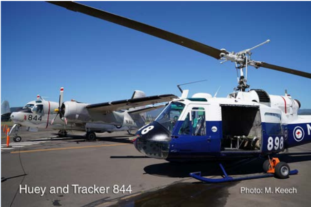
Huey and Tracker 844