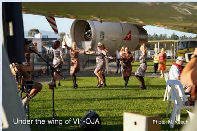
Under the wing of VH-OJA

On 15 and 16 November HARS Aviation Museum hosted two official events to celebrate 100 years since the founding of Qantas. A barbecue was held under the wing of our ex-Qantas 747-438, City of Canberra, on the Sunday afternoon attended by many current and retired Qantas flight attendants and flight crew. On the Monday evening, 16 November, the date of the centenary, a formal dinner was held under the wing of our Super Constellation, Connie.