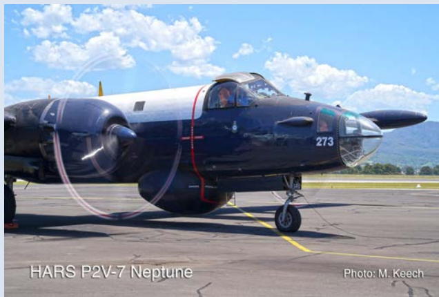
HARS P2V-7 Neptune