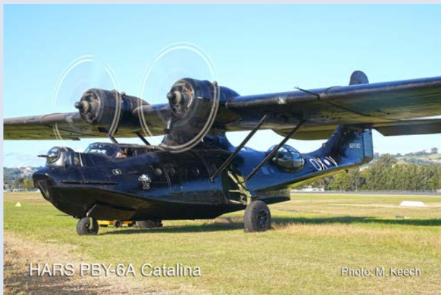
HARS PBY-6A Catalina

programmed to participate in the flypast.