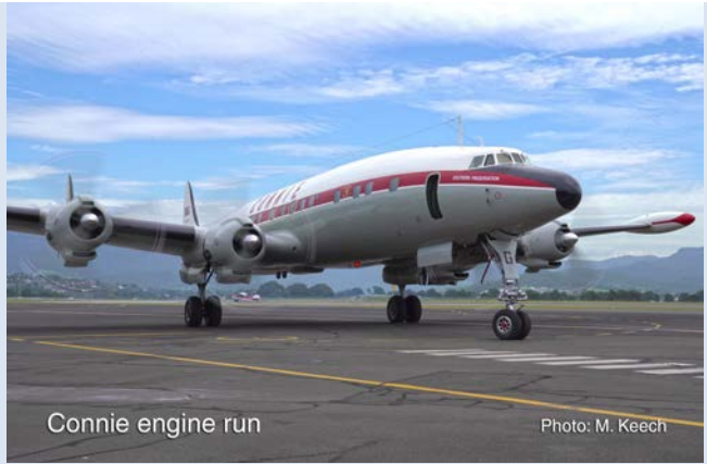
Connie engine run