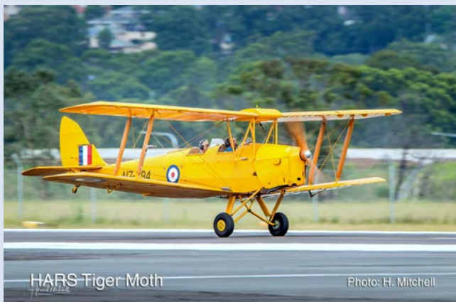
HARS Tiger Moth